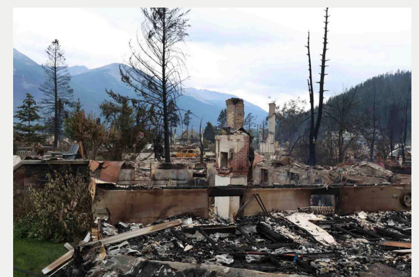
Parks Canada. (August 16, 2024). Turret Street overlooking Miette Avenue [Photograph]. https://parks.canada.ca/pr-np/ab/jasper/visit/feu-alert-fire/feudeforet-jasper-wildfire/dommage-damage .