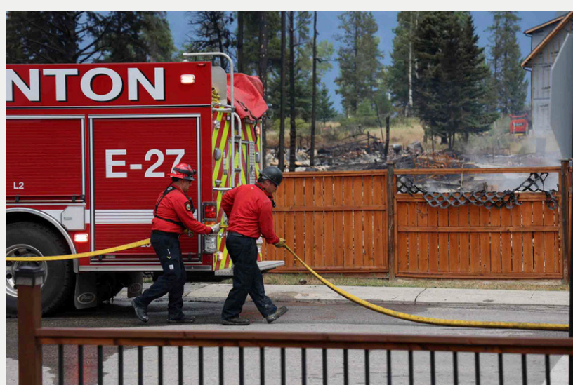
Parks Canada. (August 16, 2024). Ash Avenue - Local Firefighters at work [Maps]. https://parks.canada.ca/pr-np/ab/jasper/visit/feu-alert-fire/feudeforet-jasper-wildfire/dommage-damage .