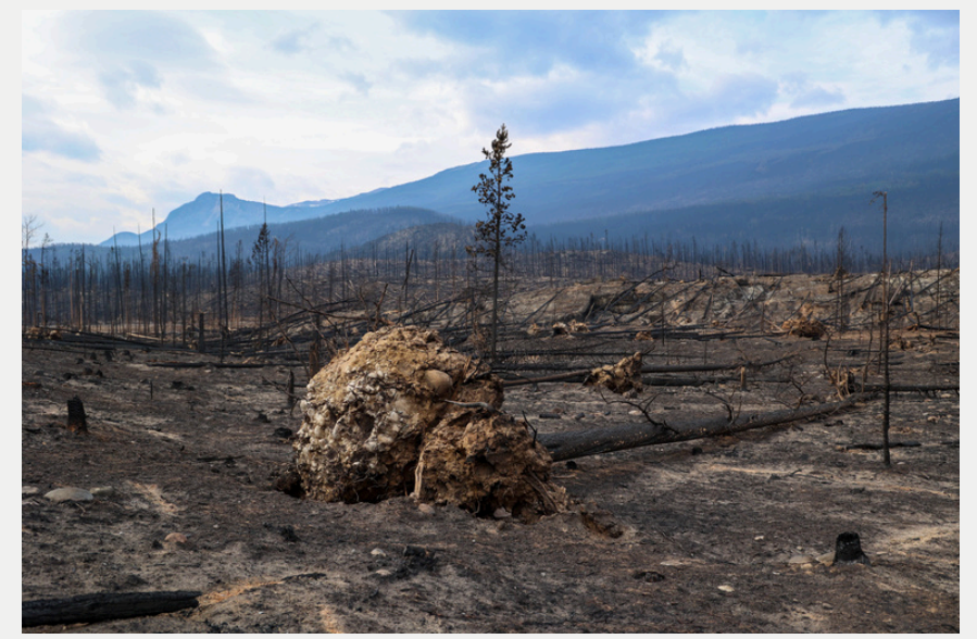
Parks Canada. (July 29, 2024). Wabasso Campground Jasper National Park [Photograph]. https://parks.canada.ca/pr-np/ab/jasper/visit/feu-alert-fire/feudeforet-jasper-wildfire/dommage-damage .