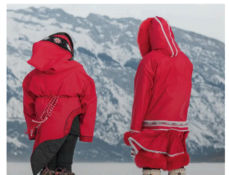
Two Inuit women wearing an amauti, a traditional Inuk woman's parka designed with a hood for carrying babies, varying in style by region but remaining an unmistakable symbol of Inuit women.