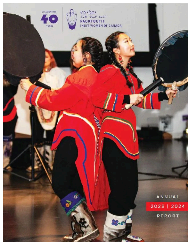
Logo and Annual Report Cover of Pauktuutit, Association for Inuit Women of Canada