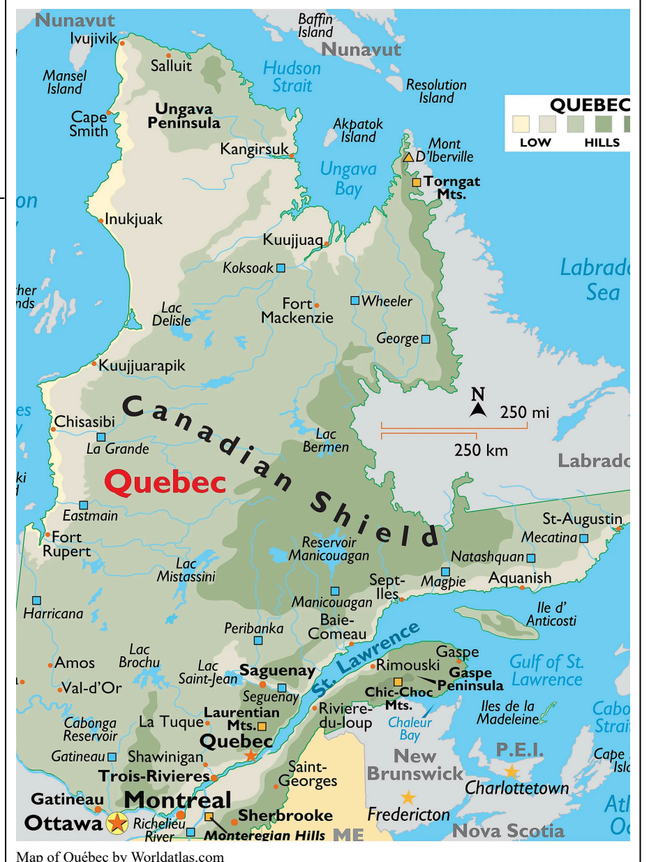
Map of Québec by Worldatlas.com