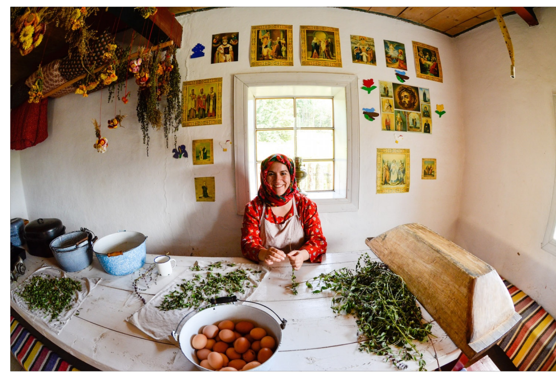
Ukrainian cultural heritage village near Edmonton, Alberta.