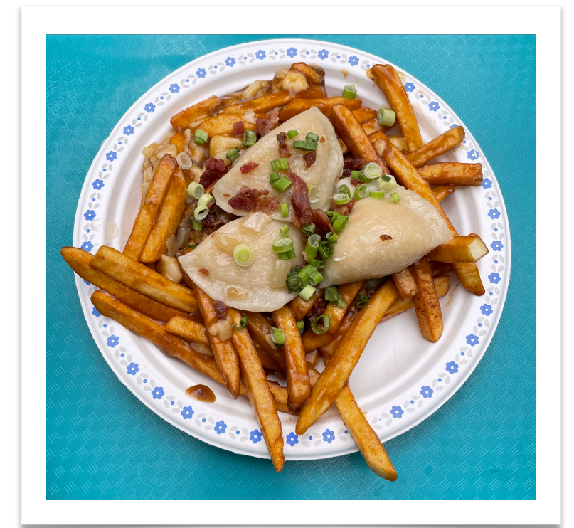
Ukrainian varenyky and Canadian poutine combined in one dish. Ukrainian heritage village near Edmonton, Alberta.

The scientific novelty of the obtained results follows from the relevance of the topic and the absence of such comparative studies. The practical significance of the work is revealed from the results of empirical research, which provides systematization of the recipes and comparison of the menus of Ukrainian restaurants in Ukraine, Canada and the United States, for a general picture of understanding the differences between national cuisine in isolation from the country of origin.