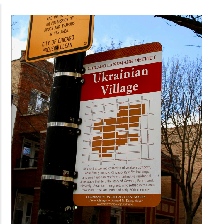
Ukrainian Village street sign, Chicago, Illinois.