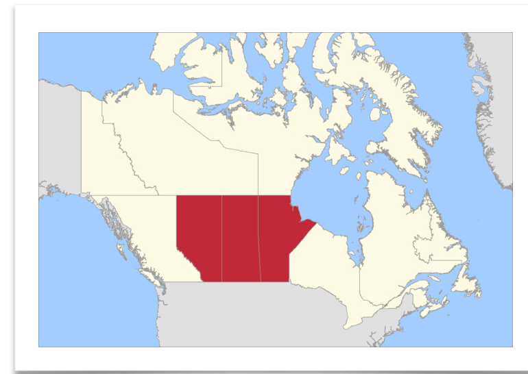
Prairie provinces are the traditional region of the Ukrainian settlements in Canada.

The question of the relationship between ethno-national identity and traditional Ukrainian cuisine is sufficiently unexplored. That is why the relevance of the dissertation research is due to the increasing practical and scientific interest in understanding the identity of Ukrainians and its manifestation through the national cuisine, given recent events with the attempts by Russia to appropriate specifically Ukrainian dishes. Migration processes also influence the change of approaches to gastronomic preferences. In particular, they are reduced to revealing the role and significance of national traditional dishes as one of the symbols of Ukrainian national identity in the context of political processes.